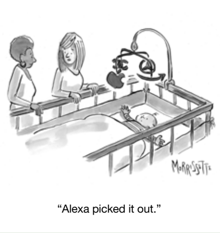
“Alexa picked it out.”