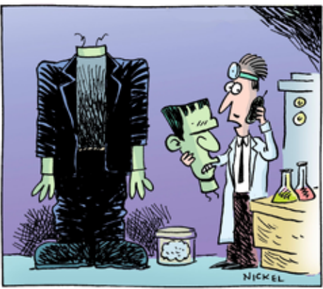
“Hello, tech support?”

We love having you as a customer and, quite honestly, wish we had more like you! So instead of just wishing, we’ve decided to hold a special “refer a friend” event during the month of October. Simply refer any company with 10 or more computers to our office to receive a FREE computer network assessment (a $397 value). Once we’ve completed our initial appointment with your referral, we’ll rush YOU a free Kindle Fire of your choice as a thank-you (or donate $100 to your favorite charity ... your choice!). Simply call us at 847-348-3381 with your referral’s name and contact information today!